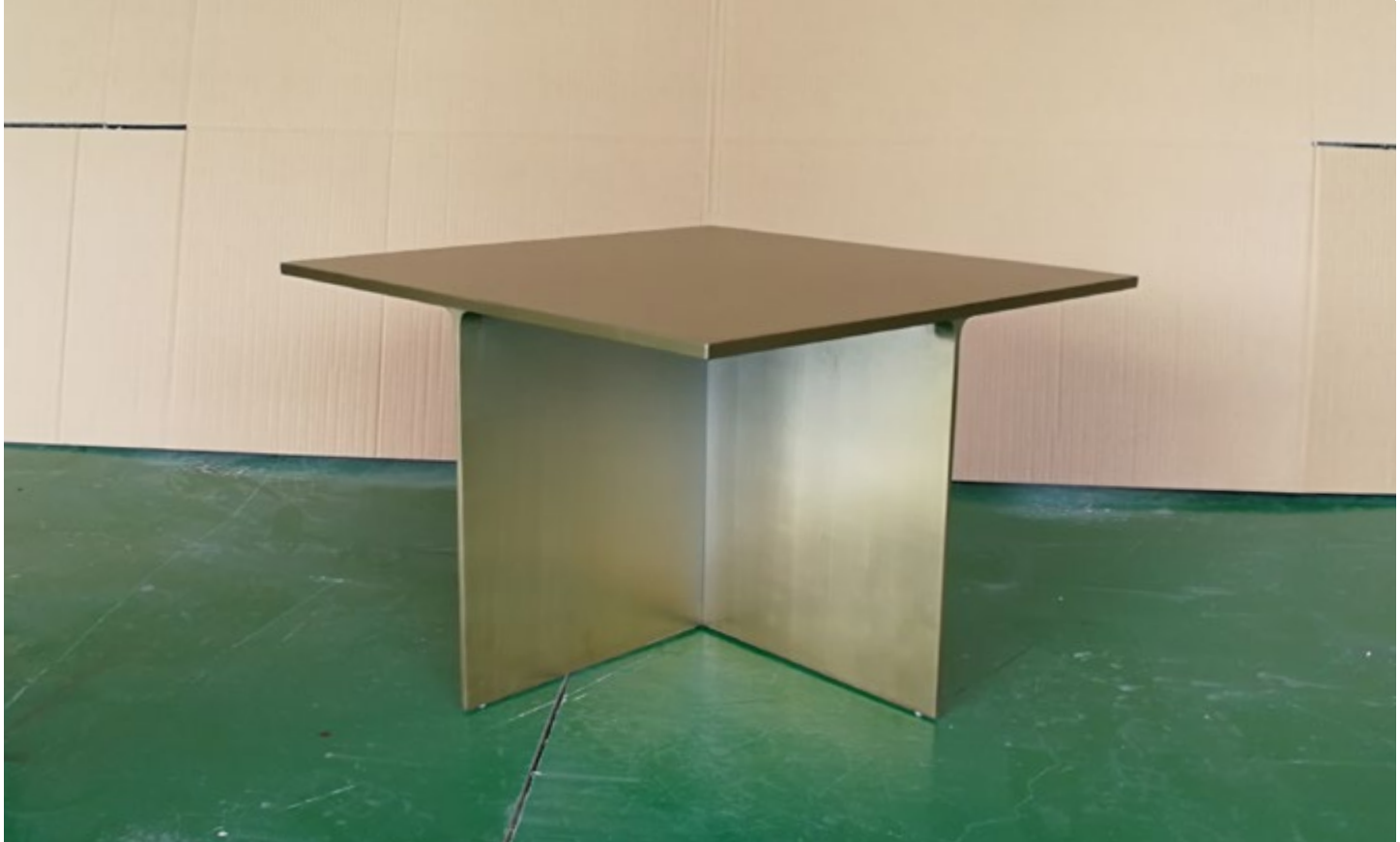
SP.1103 Coffee Table