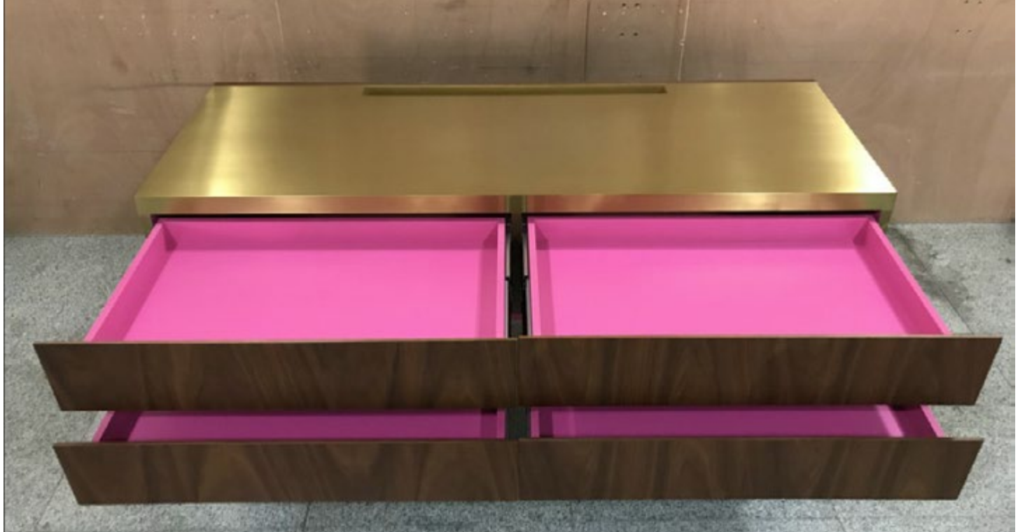
SP.969 Dresser/ TV Stand