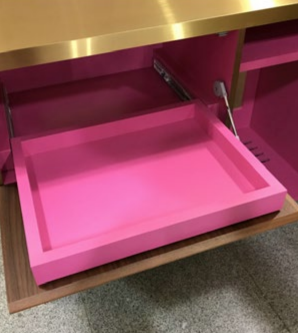
SP.963 Dresser/ Minibar