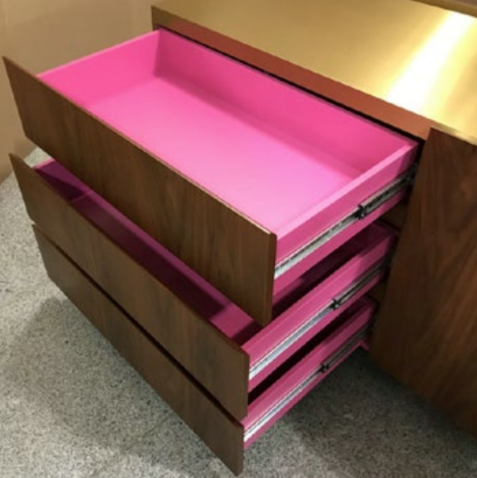
SP.962 Dresser/ Minibar