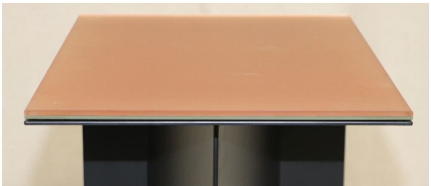
SP.1398 Side Table