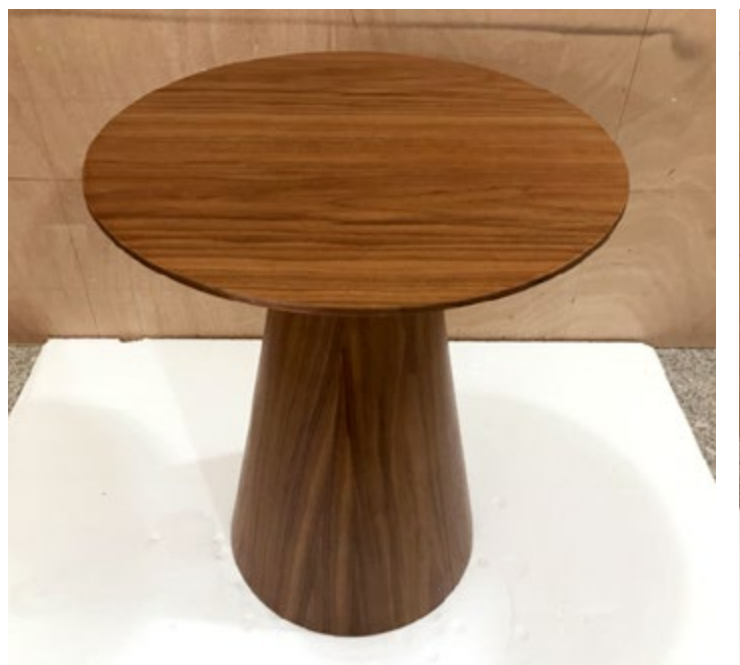
SP.967 Side Table