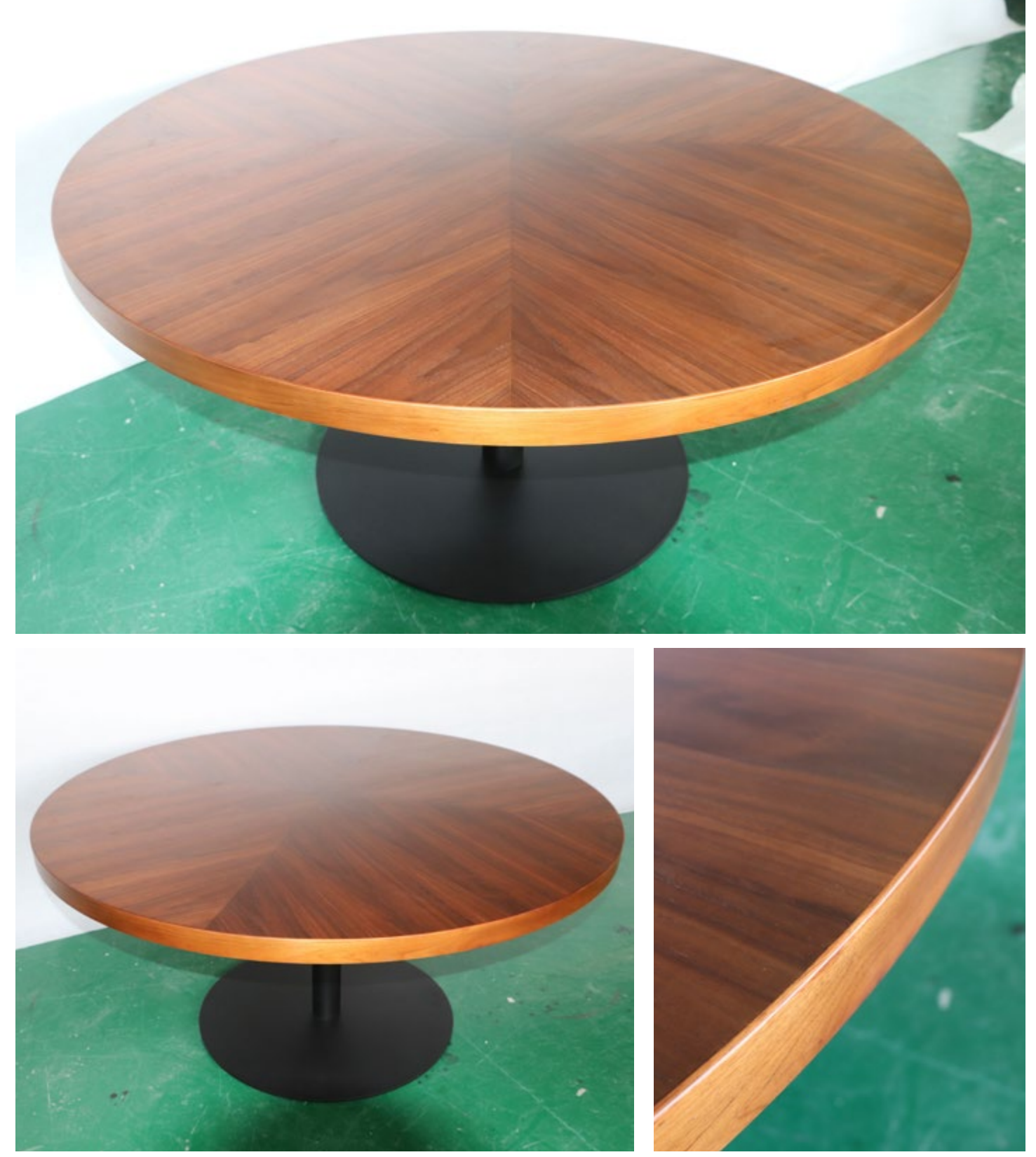
SP.1106 Dining Table