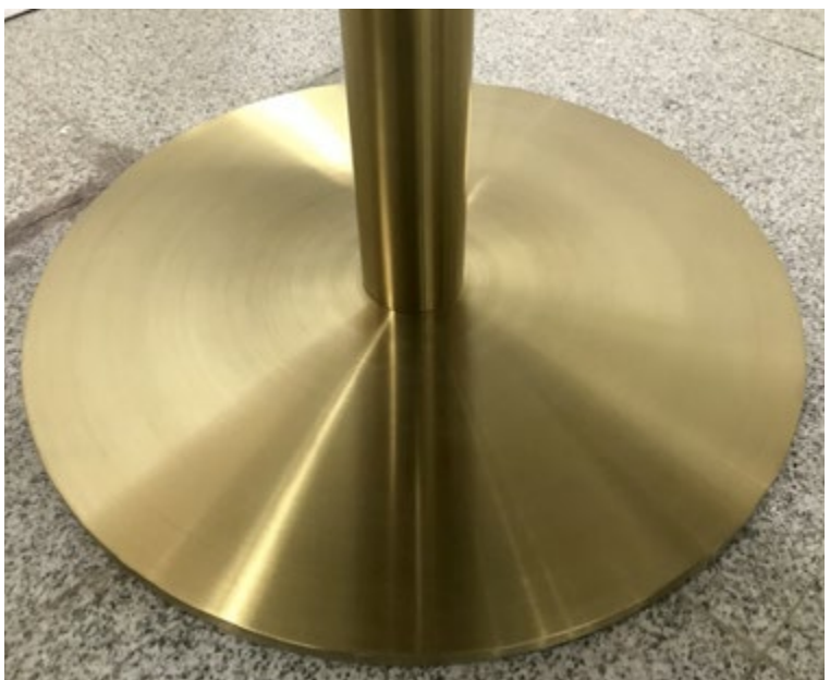
SP.966 Dining Table