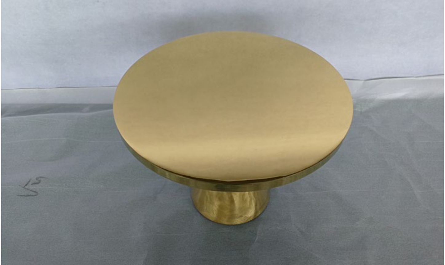
SP.1102 Coffee Table