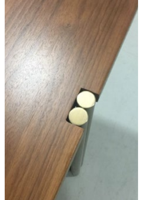
SP.1391 Coffee Table