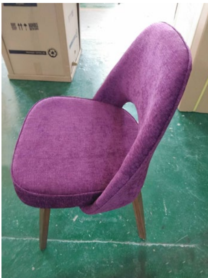
SKYC6014 Dining Chair