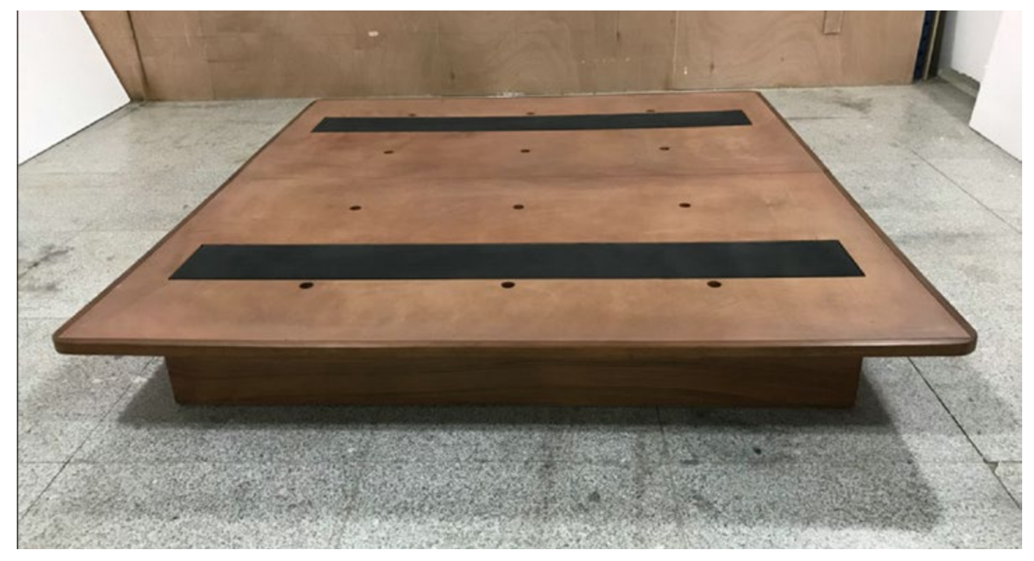
SP.959 Headboard & Bed Frame