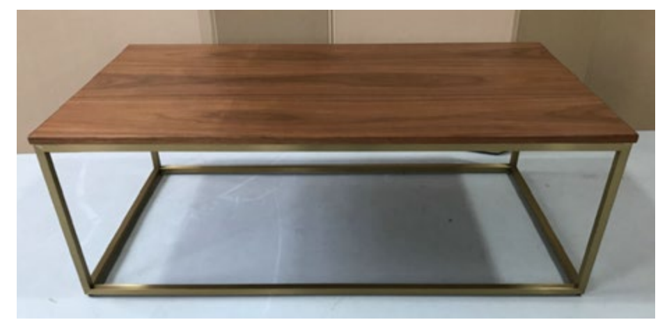
SP.976 Coffee Table