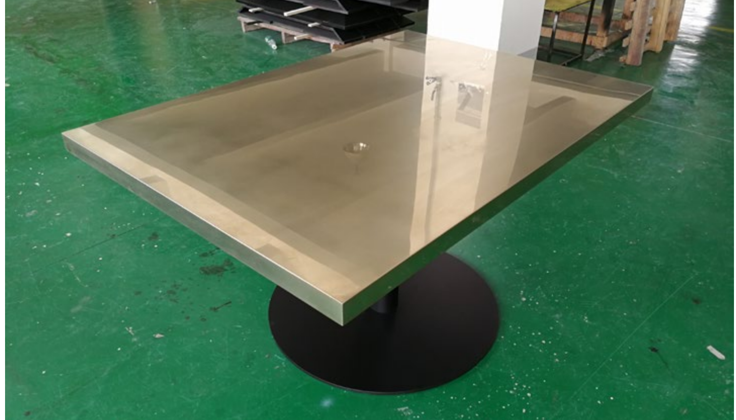
SP.1101 Dining Table