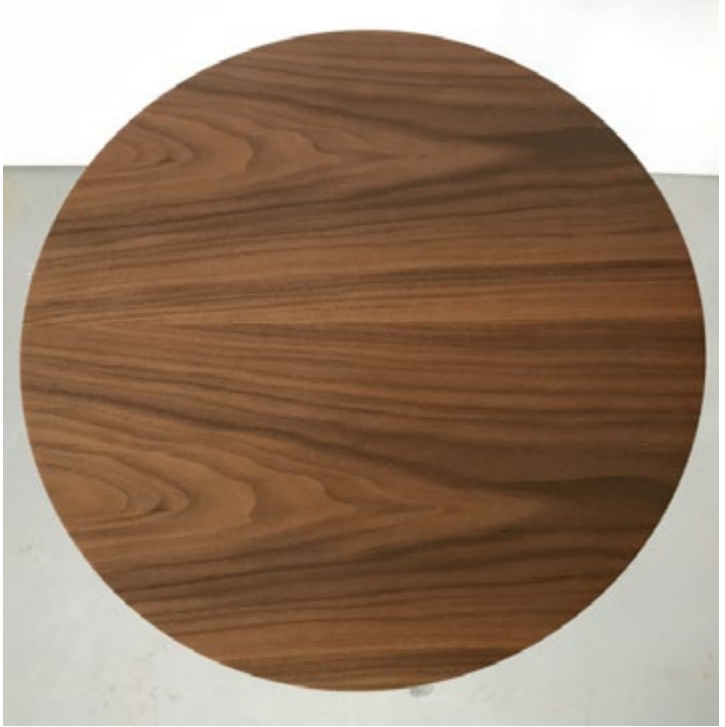
SP.1394 Side Table